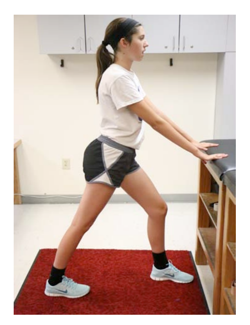
Standing Hip Flexor Stretch