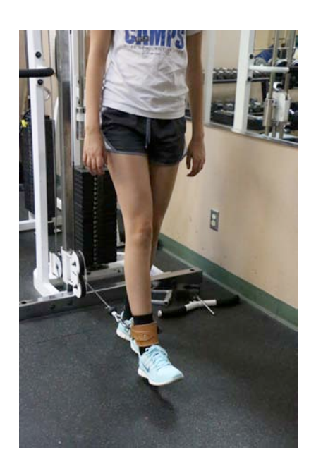
Cable Column Hip Extension