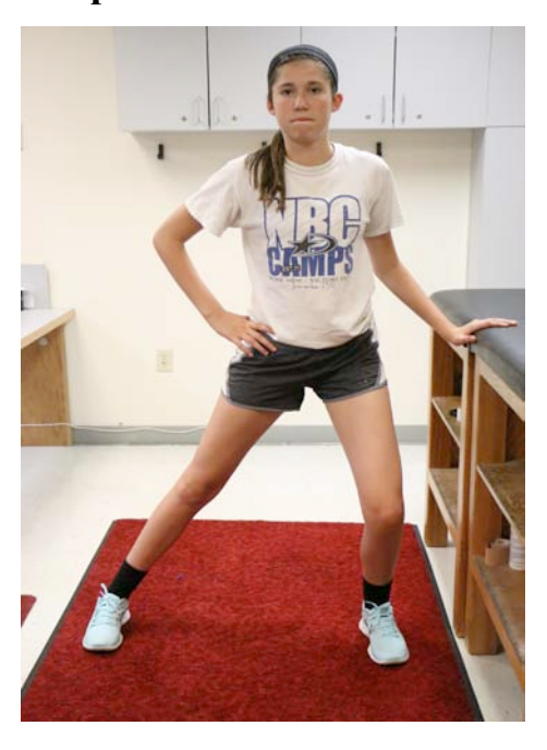
Standing Adductor Stretch