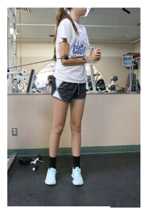
Cable Column Bilateral Rotations \rightarrow Progress to 1 leg