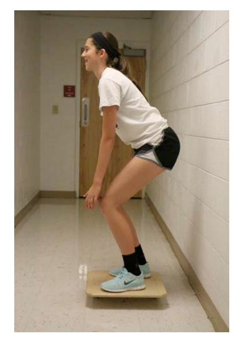
Mini Squats on Balance Board