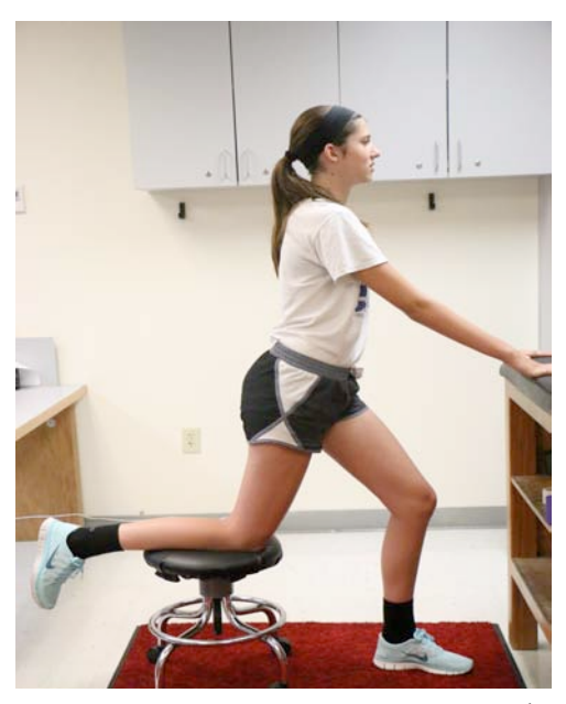
Hip Flexor Stretch with Stool: Place involved knee on stool keeping hips parallel to table, then slide stool back until you feel a strong stretch in the front of your hip. Hold for 30 seconds. Repeat 3 times.